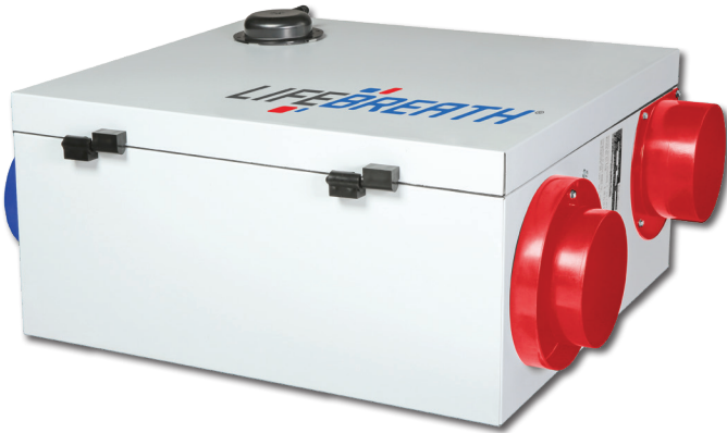
METRO 120D 136 CFM @ 0.3 (75) IN. W.G. (PA)