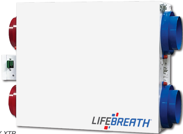
MAX XTR 184 CFM @ 0.3 (75) IN. W.G. (PA)