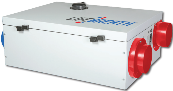
METRO 120F-ECM 117 CFM @ 0.3 (75) IN. W.G. (PA)