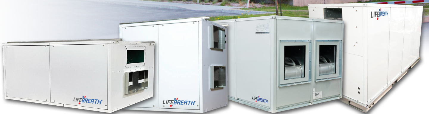
650 DD / 650 FD