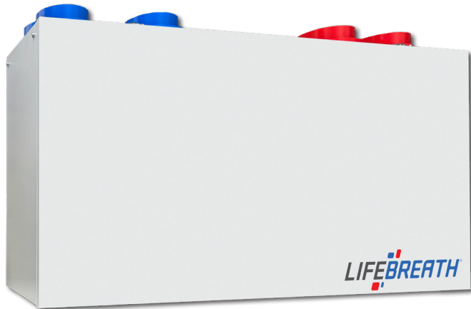
267 MAX ERV 278 CFM @ 0.3 (75) IN. W.G. (PA)